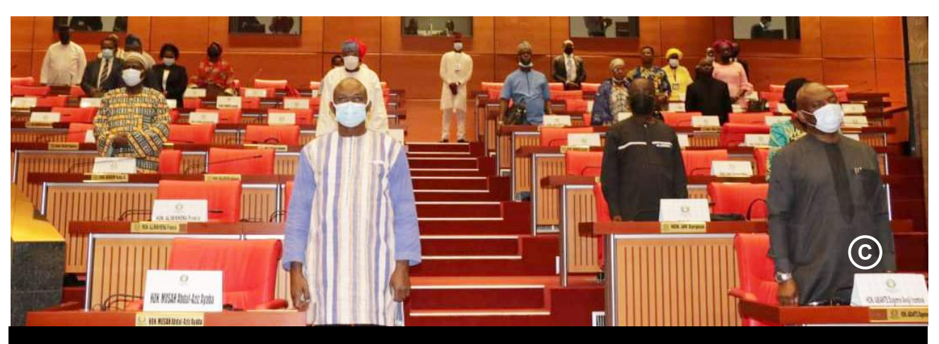
MPs at Plenary observing meditation/prayer.