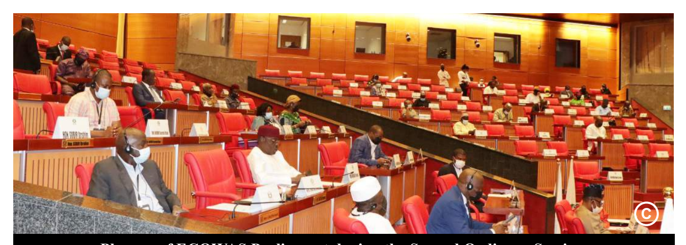
Plenary of ECOWAS Parliament during the Second Ordinary Session.