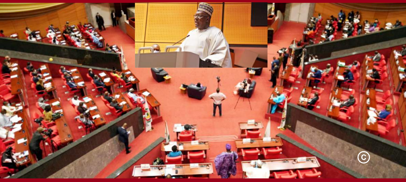
A Cross Section of Members of Parliament During Consideration of the 2022 Community Budget.

VOL.12 N° 2 PUBLICATION OF THE 2021 SECOND ORDINARY SESSION OF THE ECOWAS PARLIAMENT. NOV. 30 - DEC. 18, 2021