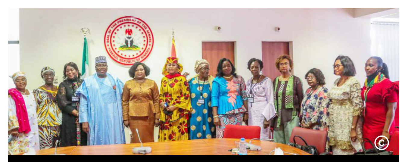
The Nigeria Senate President, Sen. Ahmed Ibrahim Lawan with the executive members of ECOFEPA during a courtesy visit.